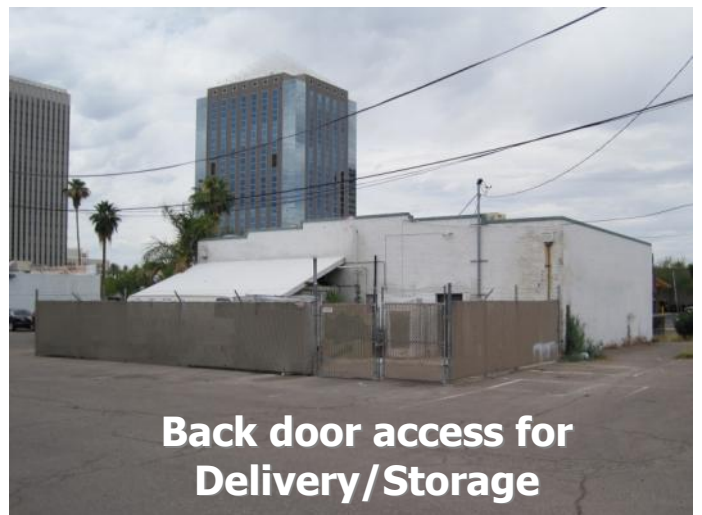
Back door access for Delivery/Storage