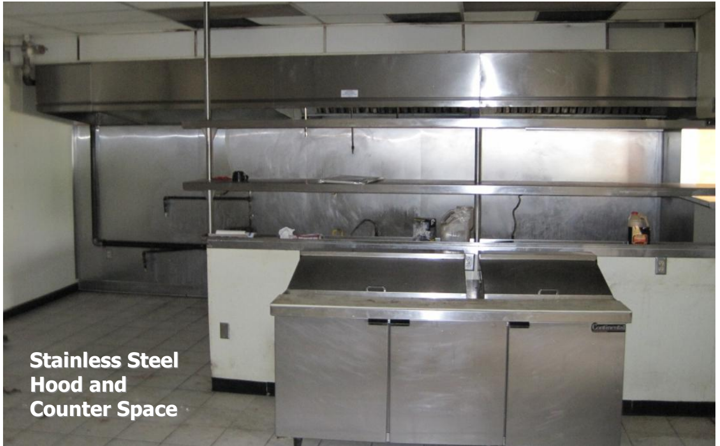
Stainless Steel Hood and Counter Space