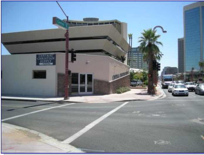
South View of the property