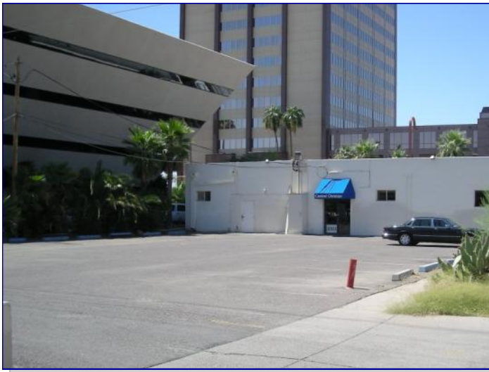
Parking in the rear of the Property