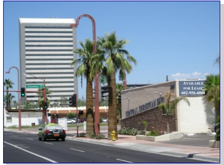
North View of the property