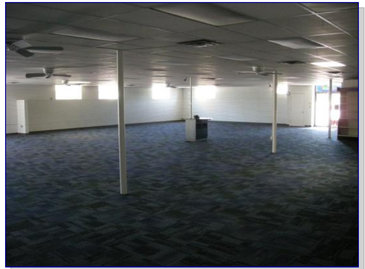
Open Space - Suitable for a Restaurant